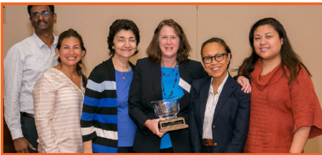
June Marcus Award