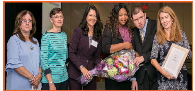
Beverly Berger Family Advocate Award